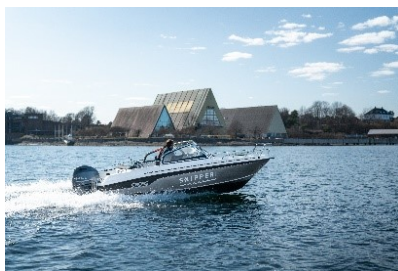
Rental boats operated by Skipperi

*2 Kando is a Japanese word for the simultaneous feelings of deep satisfaction and intense excitement that we experience when we encounter something of exceptional value.